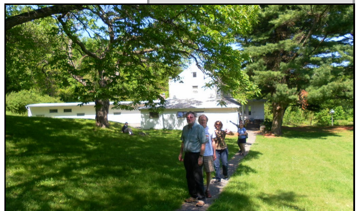
Visiting the Farmhouse

Kirkridge Retreat Center (The Farmhouse) Bangor, PA