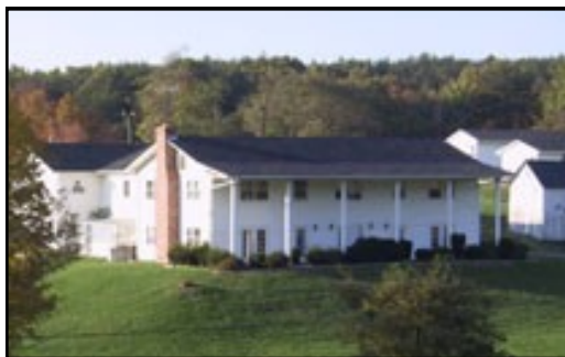
Concord's White House

Initially, Thayer will lead us for three hours in various easy-sharing experiential processes in order to develop caring, camaraderie, and trust, and to learn some self-help tools. His plan is for us to meet three times in leaderless peer groups of perhaps 15 people. The first meeting will consist of shared experiential activities, similar to what we have done at IPA spring retreats. The next two meetings will be peer-facilitated working