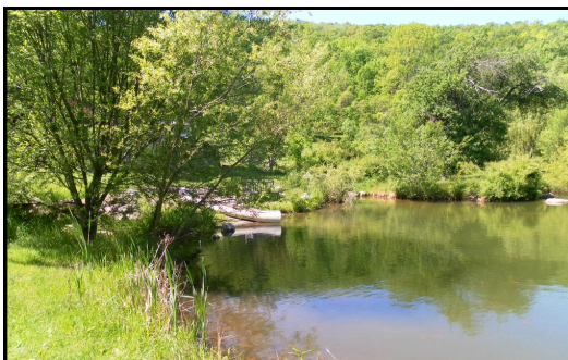
The pond at Kirkridge behind the Farmhouse

I, again, prepare myself to move as one with this powerful object. My body heaves like the ground during an earthquake. A guttural sound erupts from my depths like lava from a volcano. Progress comes in increments, not in large leaps. For a boulder does not gather much